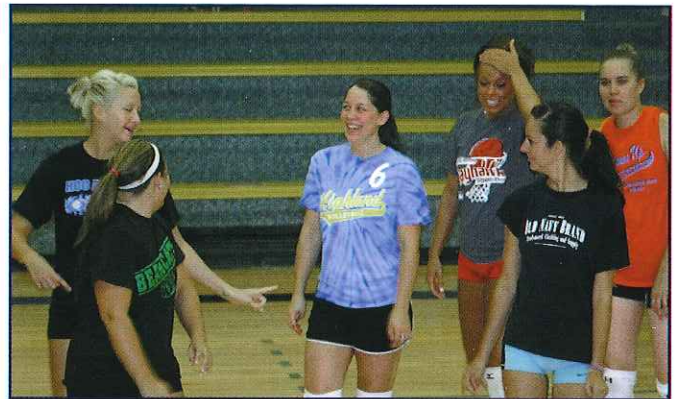
Having FUN at HCC Alumni volleyball game!