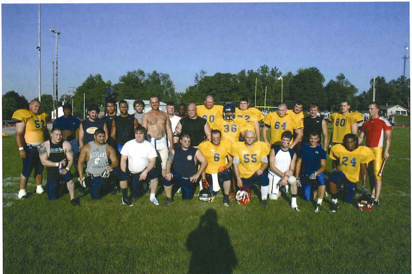
2010 Alumni Football Team