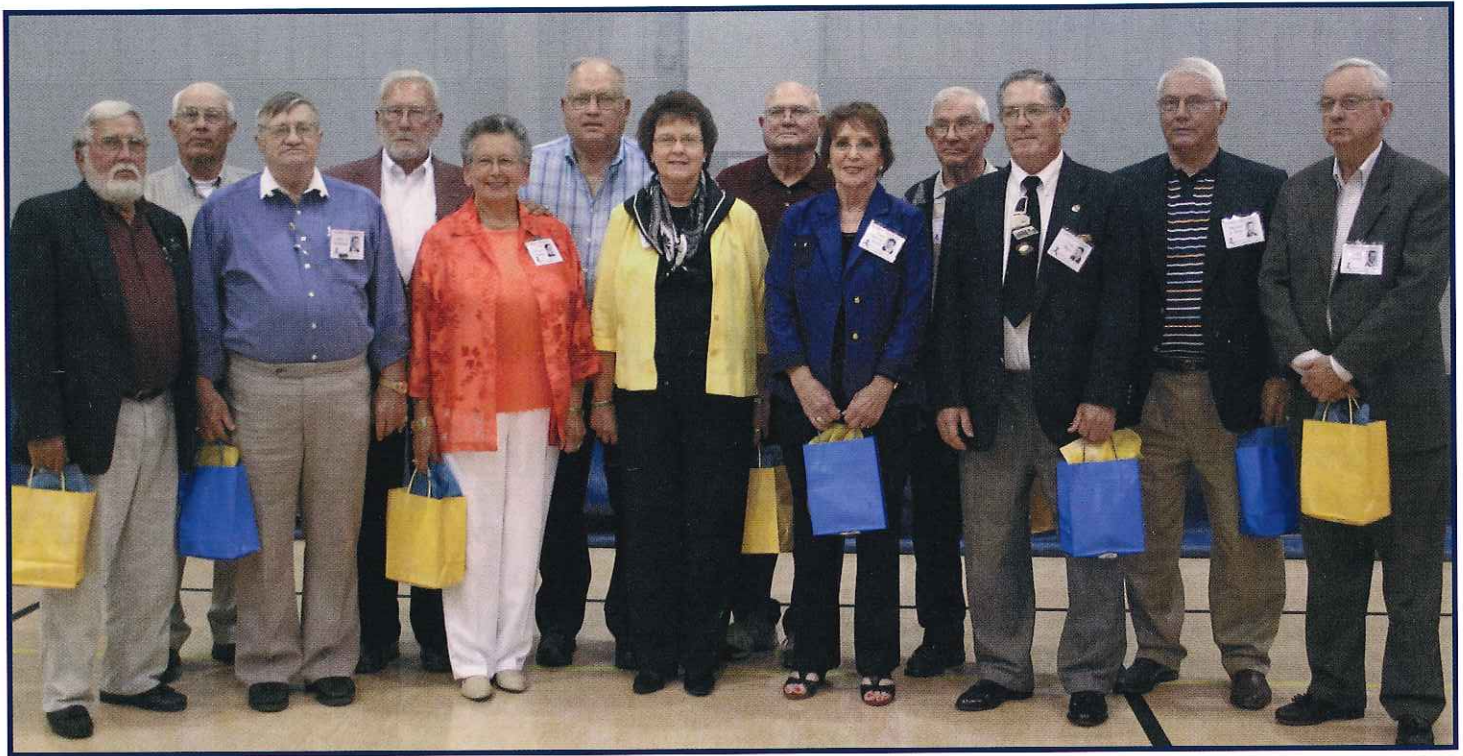
Pictured are members of the class of 1960 that attended the 2010 reunion.