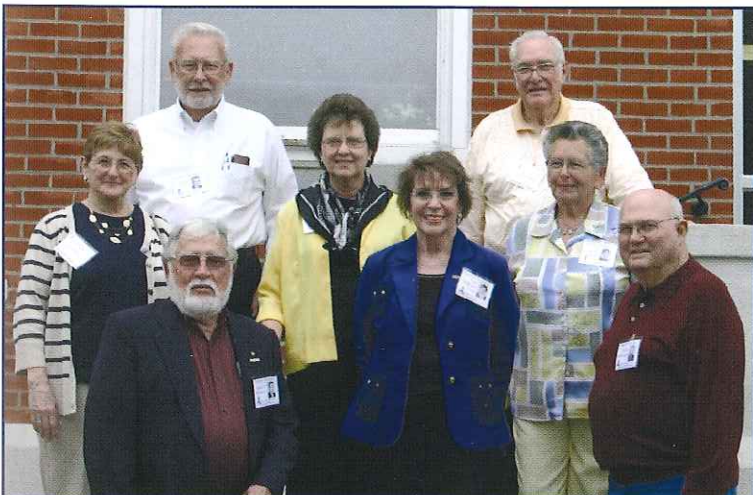
A campus tour always sparks lots of memories and stories